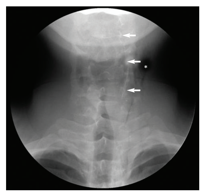
Fig. 1. A gastrografin pre-swallow image showing a small pharyngeal leak (arrows) from the left lateral wall of the oropharynx and air collections (asterisk) in the parapharyngeal and lateral deep cervical spaces.

Then, broad-spectrum antibiotics and analgesics were admin-