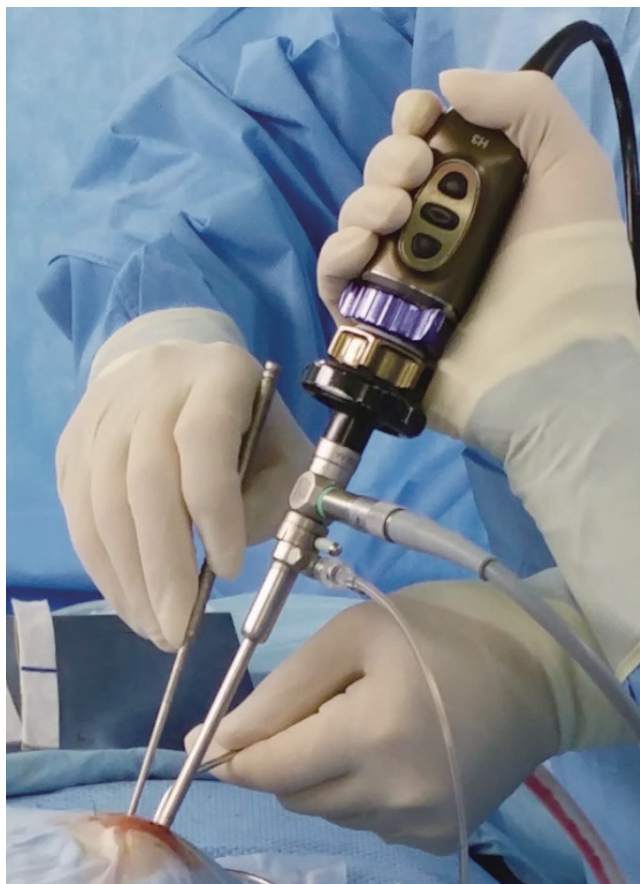
Fig. 2. The two-nostrils/four-hands technique for endoscopic skull-base surgery. Three instruments operate in very close proximity.

Many simulators feature commercial haptic devices. However, freely moving devices do not adequately improve skills and confidence. Laparoscope haptic devices are being vigorously developed. A laparoscope enters via a “port”; several mutually distant ports may be used. If an instrument port is available, haptic delivery and tracking are simple. However, the nostril is a hole, not a port. In addition, the endoscope and instruments are inserted into the ipsilateral nostril during sinus and skull base surgery; the three instruments must therefore operate very closely together during endoscopic skull base surgery using the two-nostrils/four-hands technique (Fig. 2) [36]. Therefore, the development of haptic devices is very challenging. However, training on how an endoscope and instruments interact in the nostril is very important, particularly when the endoscope is angled and the instruments are curved. The McGill simulator for endoscopic sinus surgery haptic devices improve constantly. However, one nostril-two instrument products (thin light instruments) affording realistic microsurgery feedback are essential.